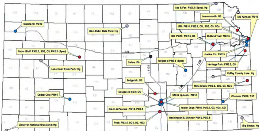
Kansas Air Monitoring Sites, August 2011