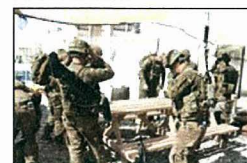
U.S. Soldiers Conduct Dismounted Patrol in Nangarhar Province ARCHIVE >>