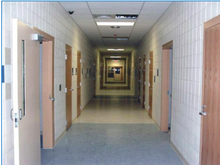
Unit Hallway Inside Isaac Ray Bldg.