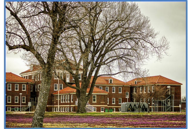
Dillon Building (view from behind)