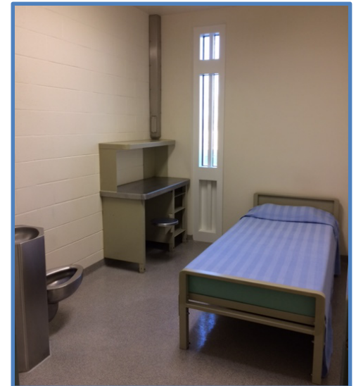
Patient Room (Isaac Ray)