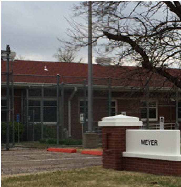
Meyer Building – Transitional Housing