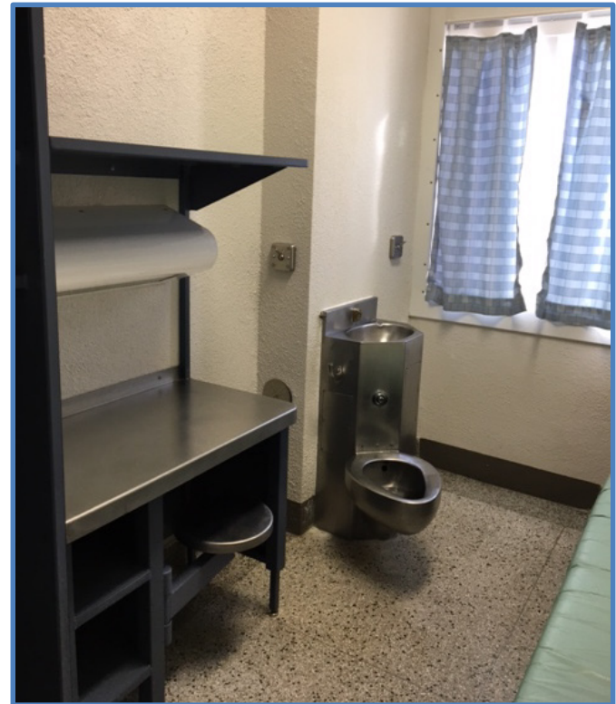
Resident Room - Dillon Building