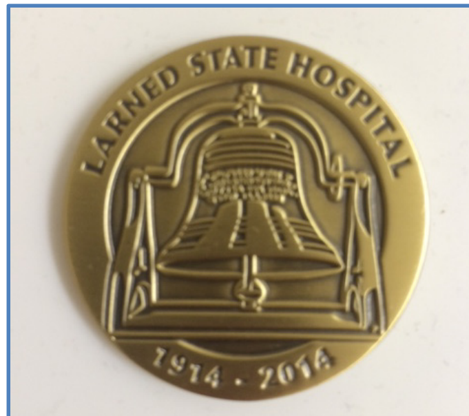
100 Year Anniversary Coin

Although met with challenges from time to time, this hospital continues to serve the citizen's of Kansas through the three distinct hospital programs which serve patients and residents as well as providing a large employment base in western Kansas.