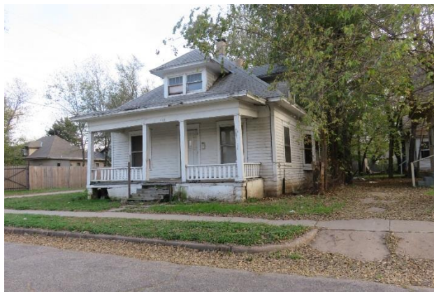
(To Be Bulldozed)