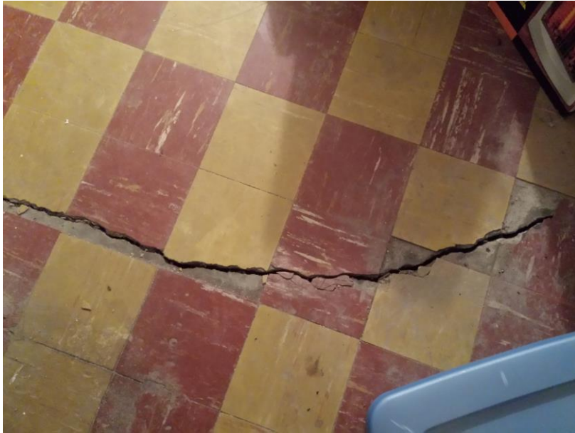
What my basement floor now looks like, post-earthquakes (photo #1)

Photos of Earthquake Damage: Lori Lawrence, 321 N. Lorraine, Wichita 67214