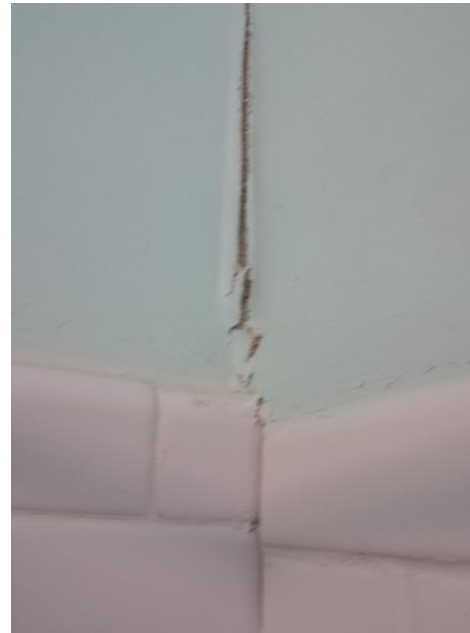
A better look at the crack in the corner of my bathroom (#3)