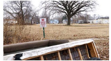
Bulldozed, trash-littered, vacant lots created by the city’s policy are a blighting influence on the neighborhood