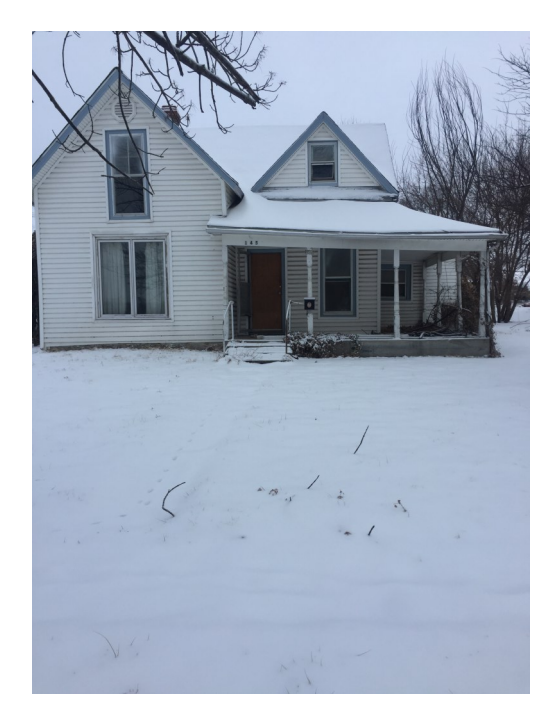
145 W. 7th