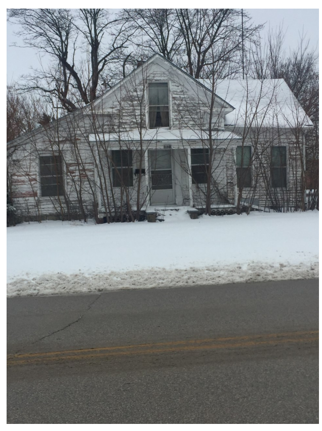
130 E. 6th