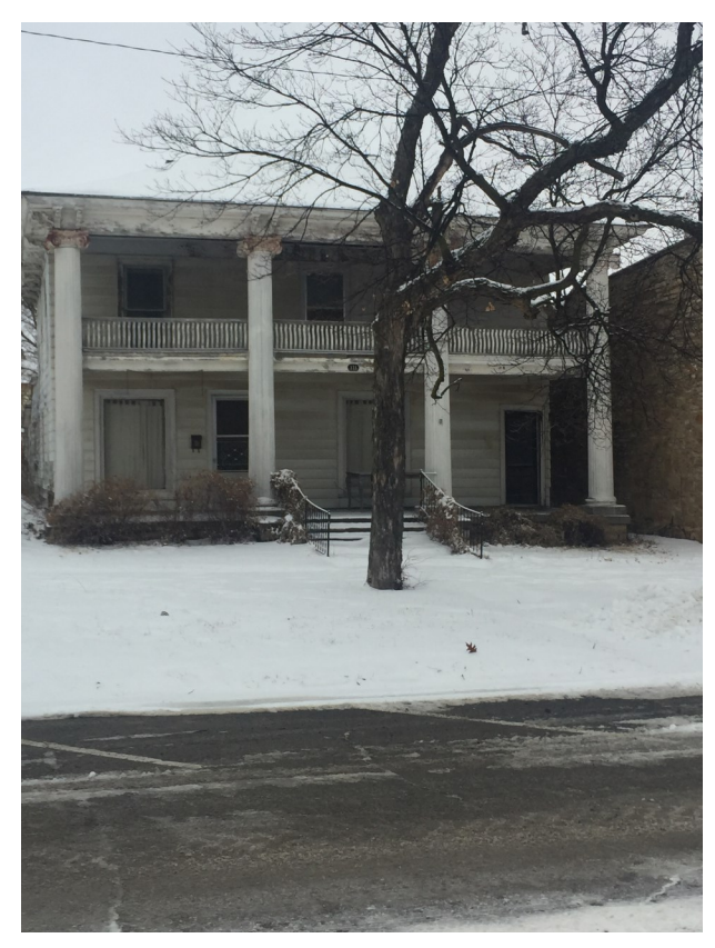
111 W. 4th