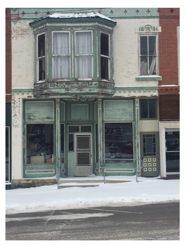
110 E. 5th