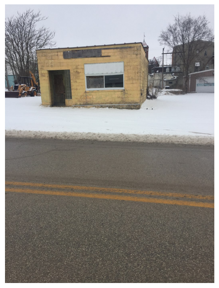
131 E. 6th