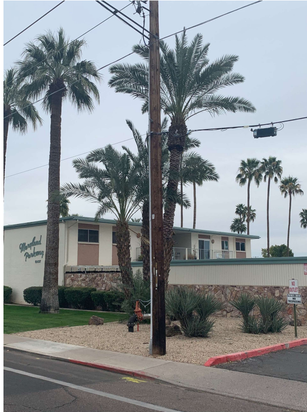
Micro Wireless Near Multi Dwelling Unit