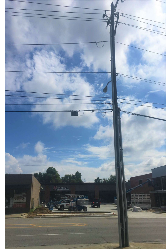
Micro Wireless Near Business Centers