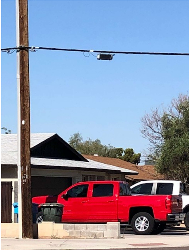
Micro Wireless Near Single Family Home