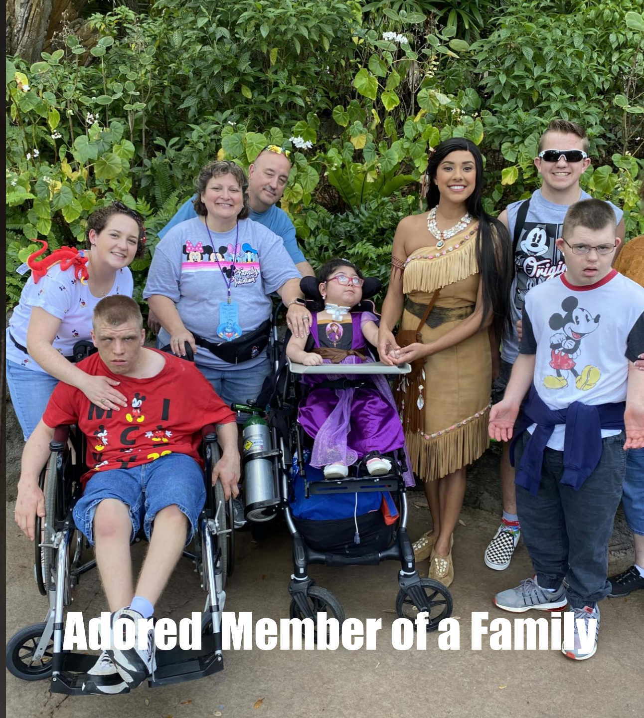
Adored Member of a Family