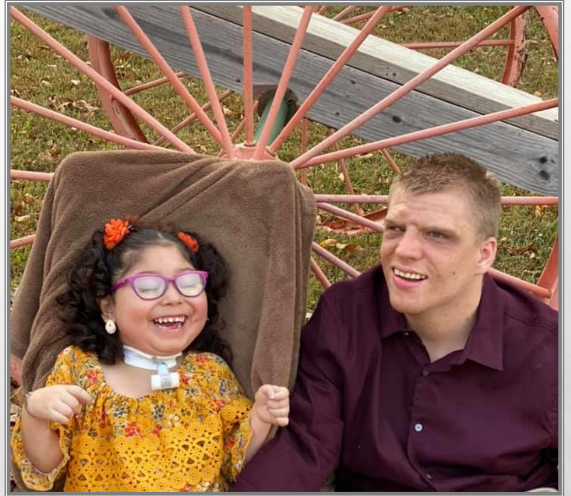
Defying the Odds